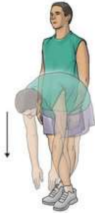
Iliotibial band stretch (standing)