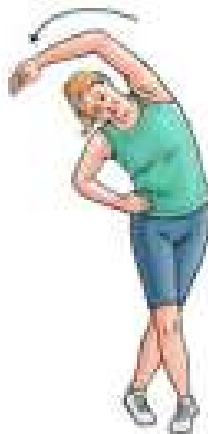
Iliotibial band stretch (side-bending)