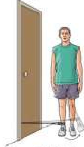
Knee stabilization: D