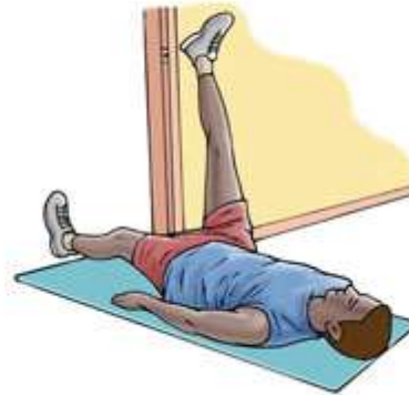
Hamstring stretch on wall