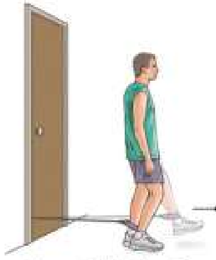
Knee stabilization: C