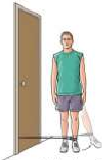
Knee stabilization: B