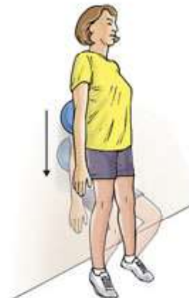
Wall squat with a ball