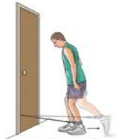
Knee stabilization: A