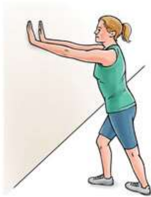
Standing calf stretch